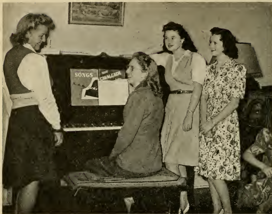
San Diego Esther Hall residents gather for a friendly sing around the piano

"In one community the churches took turns in serving good home-cooked luncheons for the war workers, many of whom lived in dormitories. One girl said, 'This is the first home-cooked food I have had in six months.'